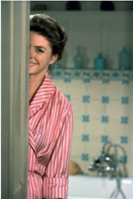
Yul Brynner Photographer